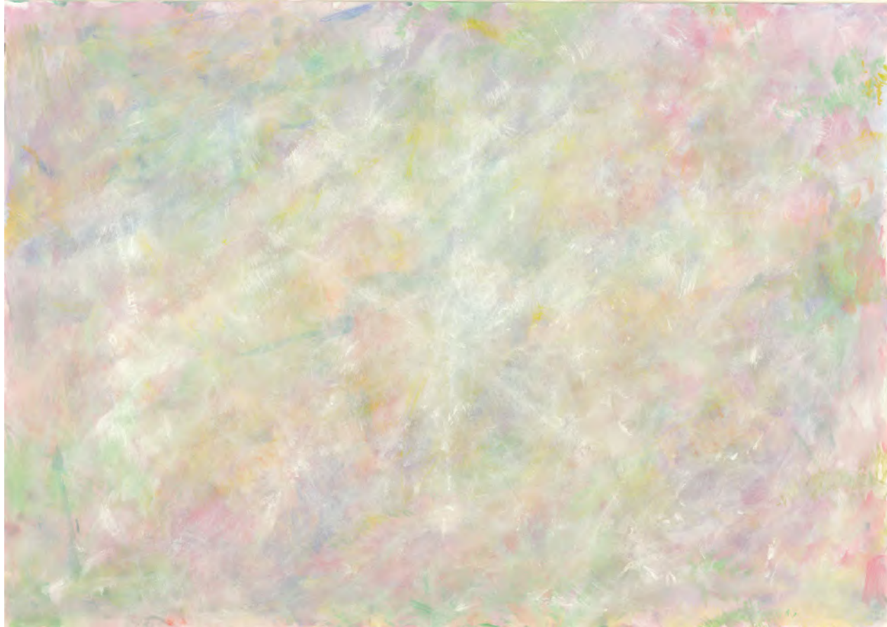
The Scent of Wind