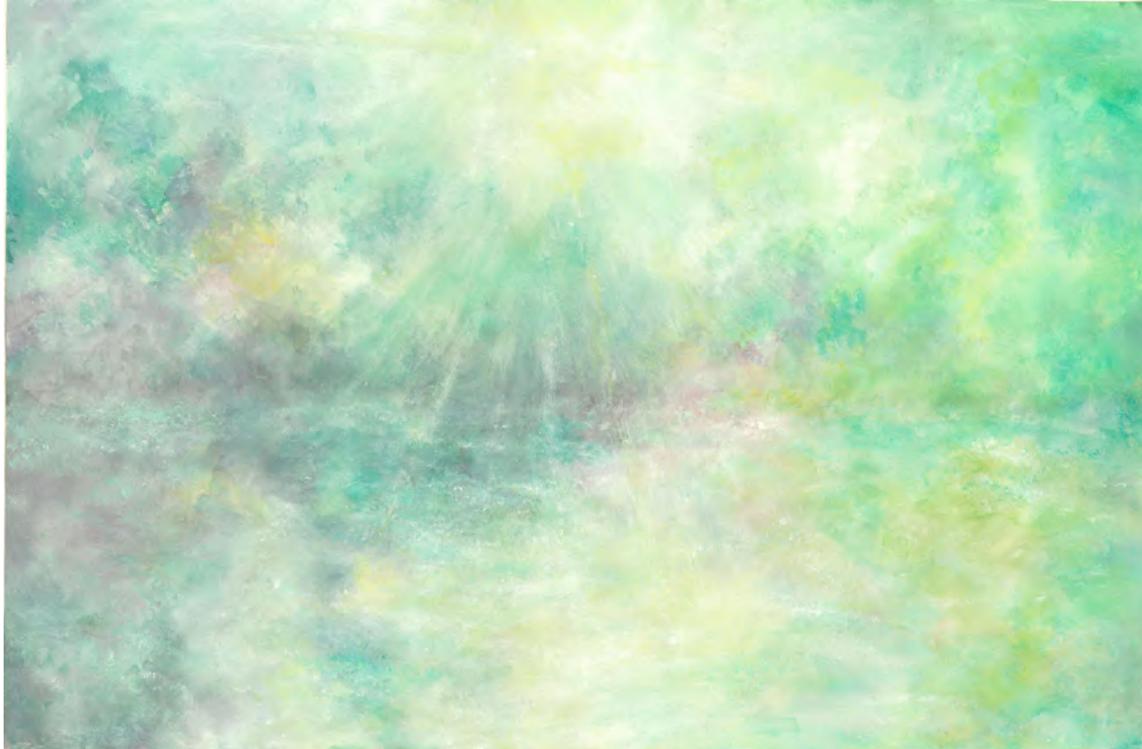
Sun over water