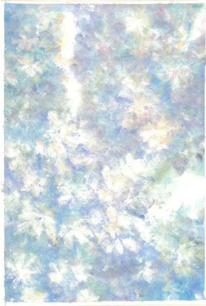
Night 1 & 2