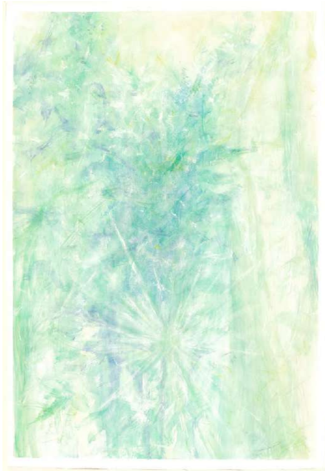
Tree behind the veil