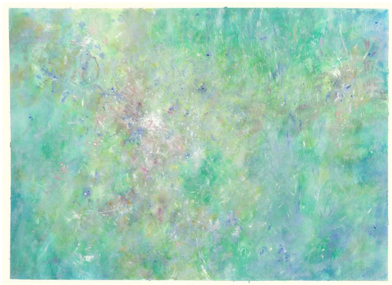
White petunias on the roadside